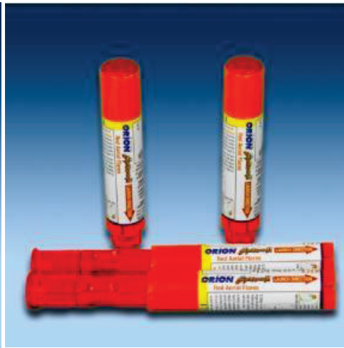
Item No. 855/855A (sold individually)