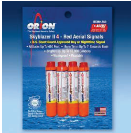
Item No. 859